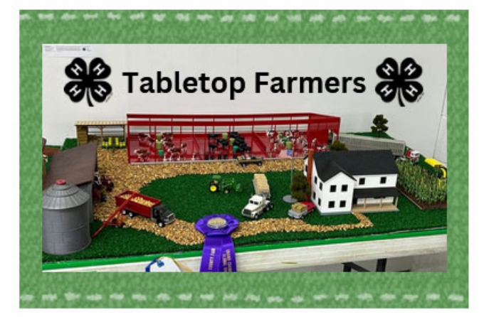
4-H Tabletop Farmers met on October 16. Each member created their own 12"x12" farm display. Their next meeting is November 13. They will work together to create a large farm display with their toys.

"Agriculture is our wisest pursuit, because it will in the end contribute most to real wealth, good morals, and happiness." – Thomas Jefferson